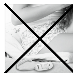
Do not sit on heating pad