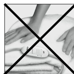
Do not sharply fold or crease heating pad