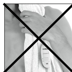
Do not use heating pad bunched up