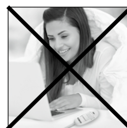
Do not use under covers