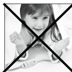
Not for use by children

For additional warnings, please see the Important Safety Instructions and Cautions sections.