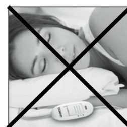
Do not sleep while using heating pad